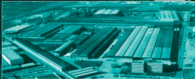
Vicenza plant, Italy