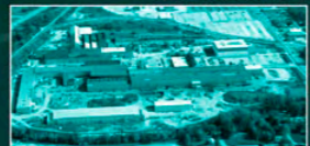
Fort Wayne plant, IN-USA

Valbruna, founded in 1925 and leader in the production of Stainless Steels, Nickel Alloys and Titanium long products, is underpinned by long experience and a highly qualified customer service.