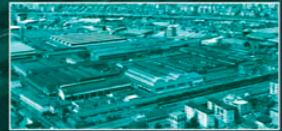
Bolzano plant, Italy