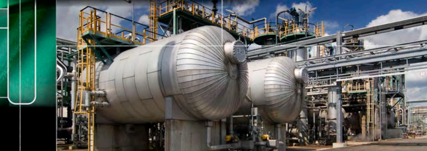
Project: Leader Global-Links